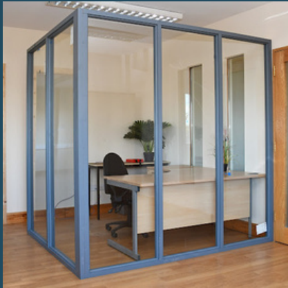
Big Tree Work Hub